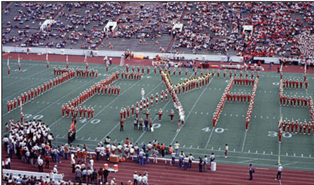
Band formation that spells out T-E-X-A-S

As in Band Geeks, during halftime, the band takes to the field and begins making formations (also referred to as drilling). Some common formations are various geometric shapes, designs, or blocks of musicians.