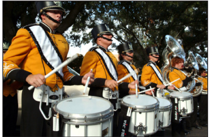
A marching band drum line.

The percussion section or drum line is the heartbeat of the marching band. They can also be called the battery or back battery. The drum line is responsible for keeping tempo and keeping the band in step. Without a steady tempo, marching can turn disastrous!