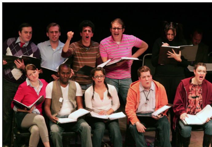
Band Geeks! reading at Goodspeed's Festival of New Artists '09.

We are thrilled to produce the first fully staged production of Band Geeks! at Goodspeed's Norma Terris Theatre this Spring (May 13 – June 6). We hope that you will join us for the next step in Band Geeks! journey - a journey which all of us at Goodspeed believe has no limit. Join us and "embrace your inner geek!"