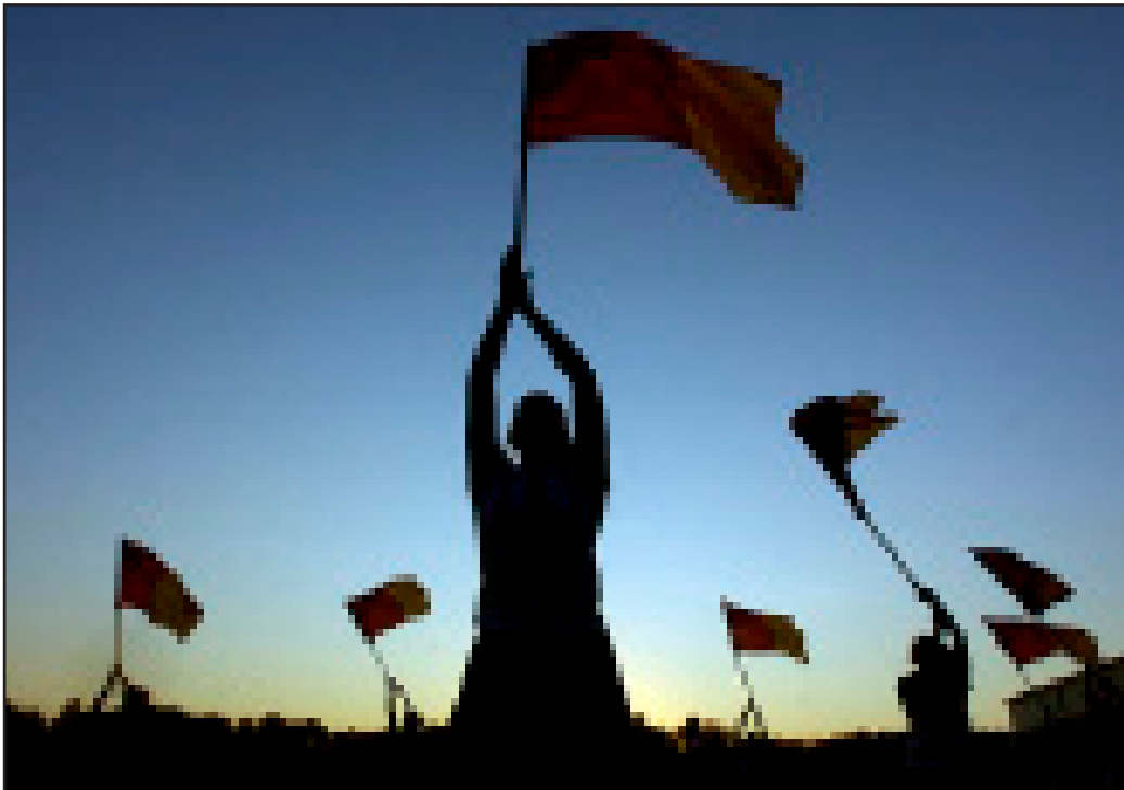
Color Guard with flags.

The Color Guard: The color guard is an aesthetic addition to the marching band that adds a great deal to the performance. In attractive bright costumes they are there to compliment the band and rally the spectators. Sometimes the color guard will use colorful flags, streamers or rifles to accent their performance. In the military the color guard was usually comprised of males, but today marching band color guards tend to be primarily female. Recently more men have become involved in color guard to help perform visual elements such as levels and speciality routines.