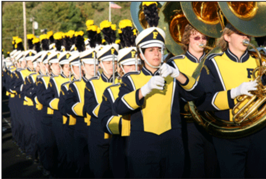
A marching band standing at attention