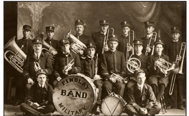
Findlay Military Band

Marching bands were first introduced in the ancient world where groups of musicians gathered together to perform at celebrations and festivals. As time passed, marching bands became associated with the army and formed military bands. As musicians became less important in directing the movement of troops on the battlefield, the bands moved into more ceremonial roles. It was from there, that the modern marching band as we know it today began.