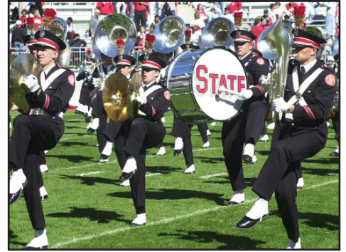
High-stepping marching band