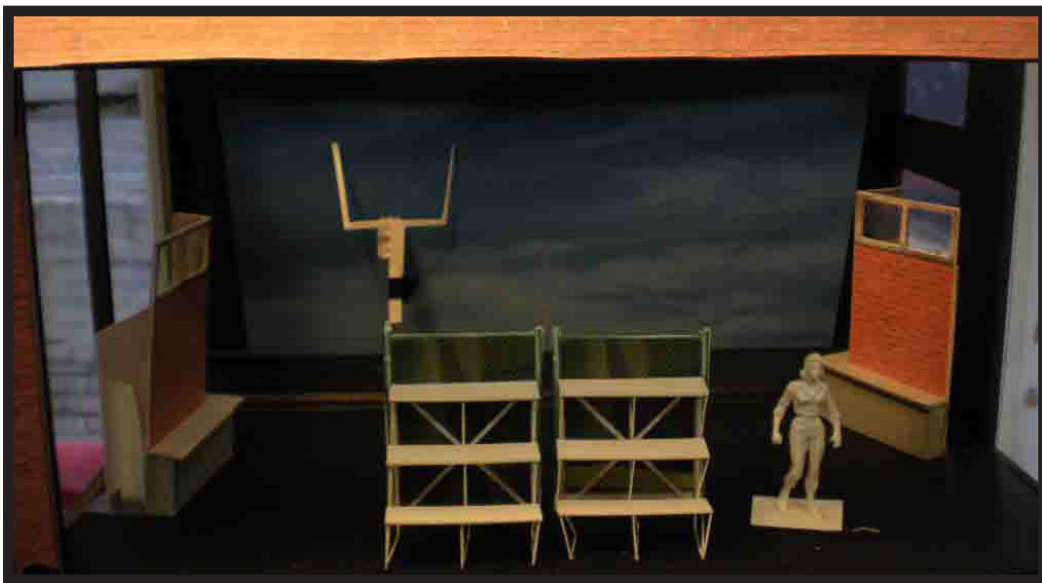
Set Model: Bleachers