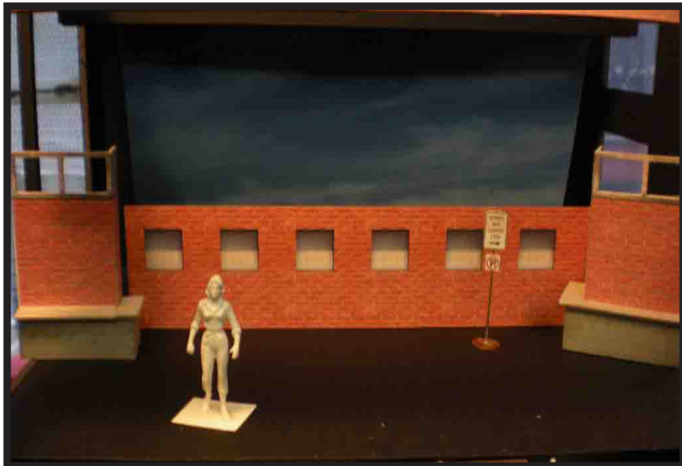
Set Model: School Exterior