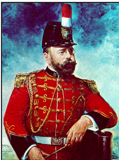
John Philip Sousa

Few American composers of the early 1900s have as much name recognition as John Philip Sousa. Known as The March King, Sousa composed 136 marches, many of which are still recognizable and very widely played by concert and marching bands today. Some of his most popular marches include "Semper Fidelis," "El Capitan," "The Washington Post," and "Stars and Stripes Forever," which is the national march of the United States. In addition to his vast band repertoire contributions, we can thank Sousa for developing the sousaphone, which is a marching instrument used instead of the cumbersome concert tuba. Sousa began his fabled fifty-two year career as bandmaster when he was chosen to become Director of the United States Marine Band in 1880. After a two year stint with The President's Own, he started Sousa's Band. Sousa's innovative compositions and conducting style brought the innocent energy of turn-of-the-century America across the globe and left us with an incredible legacy of enduring classics.