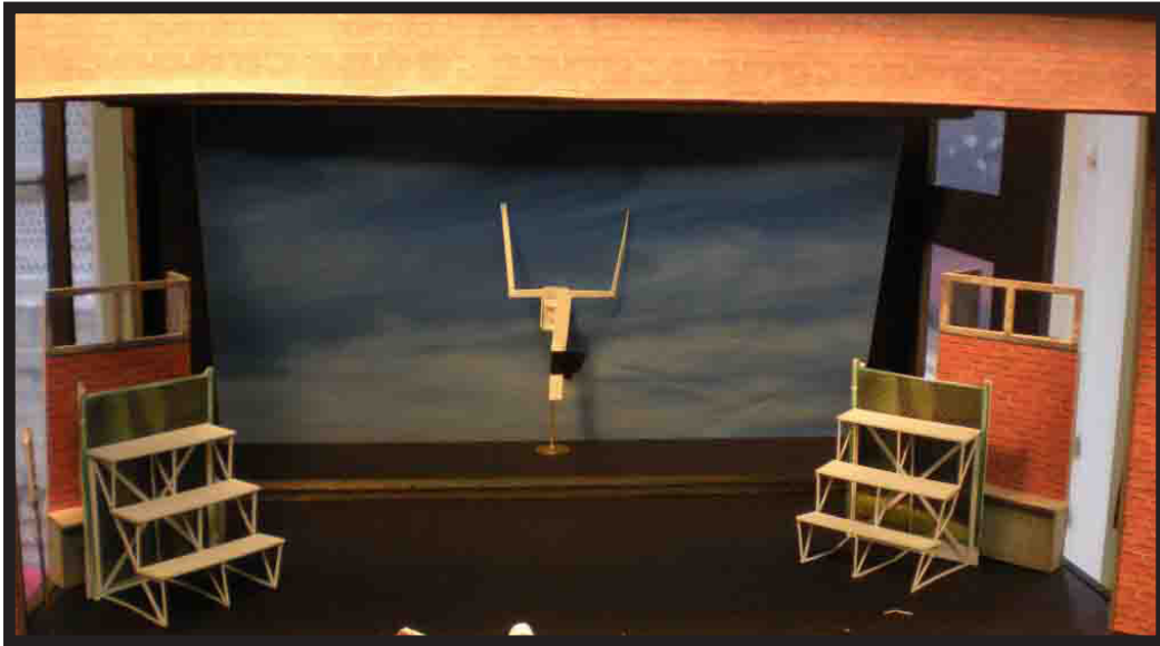
Set Model: Stadium